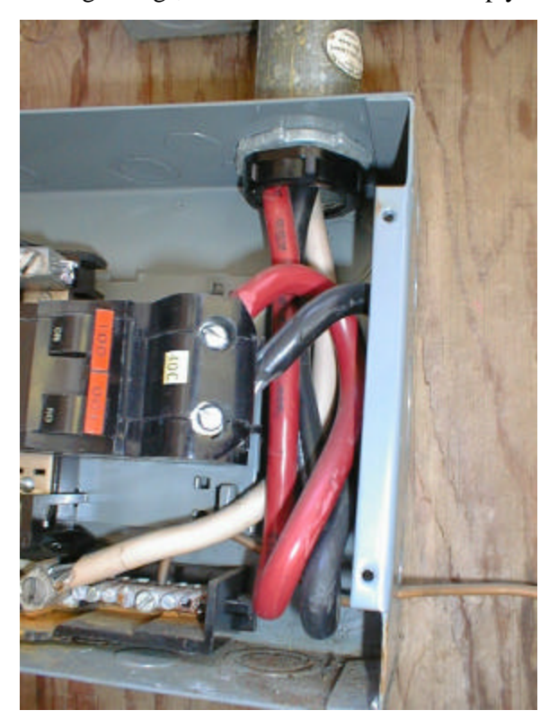
Figure 1 – Insufficient wire bending space

significant changes in the 1981 NEC, near the very end of the days when FPE panels were made. However, FPE was able to manufacture panels with even less clearance than the pre-1981 rules by installing the lugs at an angle, so the conductor was already parallel to the wall opposite the breaker terminal. However, the bends shown in figure 1 defeat the purpose of the angled lugs, and the wire is bent too sharply.