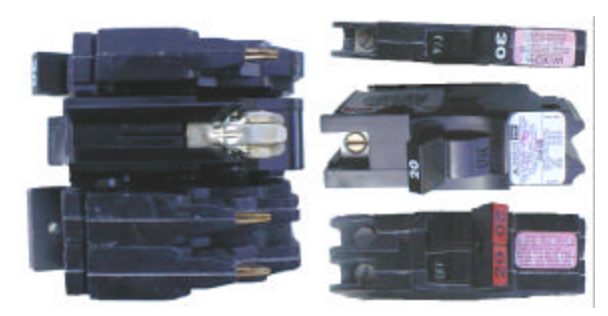
Figure 5 - "E" and "F" Breakers

Most plug-in circuit breakers have a set of jaws that fit over a bus bar, bringing the metal of the jaw into a parallel position to the bus bar. The FPE Stablok design is the opposite; the breakers have a set of prongs that are inserted into a slot in the bus bars (figures 4&5). The result is a connection between two pieces of metal that are at right angles to each other, only touching at their edges. One of the common FPE problems is to find the breakers loose in the bus bars. Good electrical connections require contact pressure. If the FPE stab only touches one edge of the opening in the bus, the lack of contact pressure and the small contact area will combine to produce arcing and overheating. A common report from the field is to find scorch marks on FPE bus bars once the breakers have been removed, as in figure 6.