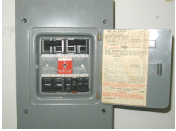
Figure 2 – Breakers that are on when down

Since the 1984 edition of the NEC, breakers that operate with their handles in a vertical position must be on when in the up position, and off in the down position. Prior to that time, several manufacturers made equipment such as that seen in figure 2, with a row of breakers that was on when down and off when up. The word "on" when upside down is "no."