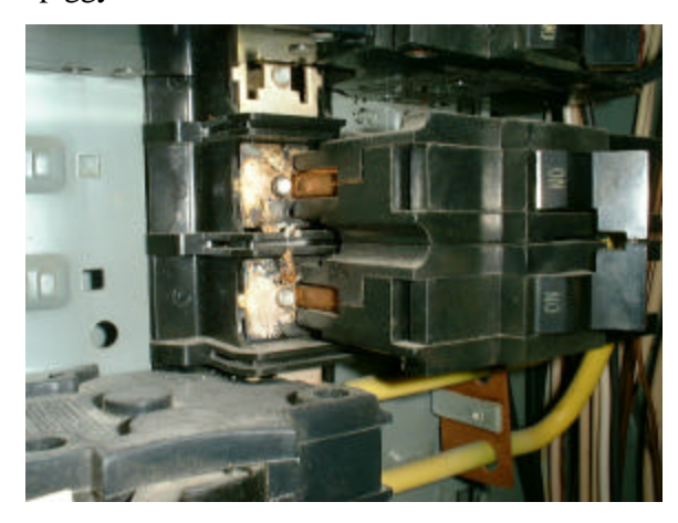
Figure 6 – Scorched Bus Bar

Most panels will accept two different sizes of breakers – full size and half size, or "wafer" breakers. By using the half-size breakers, the number of circuits in the panel can be doubled. Because more circuit breakers and more connected load will increase the heat on the bus bars, manufacturers must install some physical means of limiting the number of breakers that can be installed in the panel. Panels that have an inherent limitation on the number of breakers are referred to by UL as "Class CTL" panels, and the breakers that go into them will also be categorized as Class CTL. Most panels can be completely filled with wafer breakers without exceeding the limits set by the UL standard, which assumes 10 amps of load per breaker pole per leg. By this formula, a 100 amp panel usually has a total of 20 bus stabs. An example of something that is a half size breaker, and not class CTL, would be certain models of Square D "piggyback" breakers.