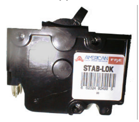
Figure 9 – Replacement Stablok breaker

If the breakers themselves are the problem, should homeowners consider replacing the breakers and keeping the panel? At various times over the last 2 decades, different manufacturers have made after-market products designed to fit FPE panels. In some cases, these breakers have been made in Canada, Mexico, or China. Salvaged old FPE breakers are also available from specialty dealers. The breakers sold under the "American" brand are not UL listed, though they are listed by ETL, another nationally recognized testing laboratory. In all cases, replacement breakers are very expensive, with a single-pole 15 amp breaker costing as much as $50. If one wanted to replace all the breakers in a panel, they could spend a great deal more than it would cost to replace the panel with modern listed equipment.