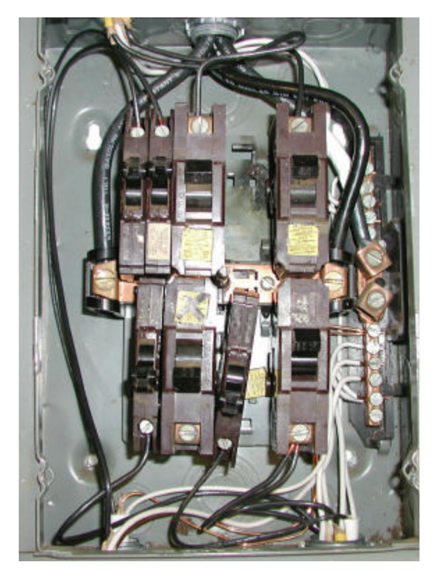
Figure 8 - Loose breaker

Not only will the "E" breaker make a poor connection in the "F" socket, it can be damaged as a result of being forced into the socket. If the installer pushes hard enough on the breaker, it will split and the bus stab will recede inside the molded case of the breaker, as in figure 7. Since it is now making a very loose contact to the bus, the breaker might fall right out when the deadfront cover is removed. Figure 8 shows an example of that condition. Inspectors can be forewarned of this condition before taking off the cover. Simply look at the label for the panel to see where the "E" slots are located and whether any "E" breakers have been inserted into "F" slots. When finding that situation, there is no need to remove the cover to know that the breaker is in the wrong position.