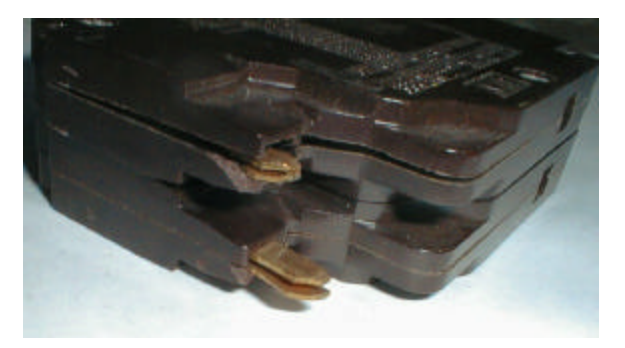
Figure 7 – Damaged "E" type breaker

The problem with this arrangement is that the "E" breaker stabs can be bent over and jammed into an "F" socket, and the result is another poor connection, as well as an overcrowded panel. Figure 4 illustrates this condition.